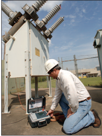
The S1-552/2 in use at an industrial complex substation

All models provide variable test voltages in 10V steps below 1kV and 25V steps above 1kV to enhance their flexibility, and to eliminate the need for multiple IR test sets to meet various applications.