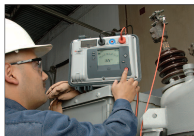
Circuit breaker being tested with the S1-552/2 Insulation Resistance Tester